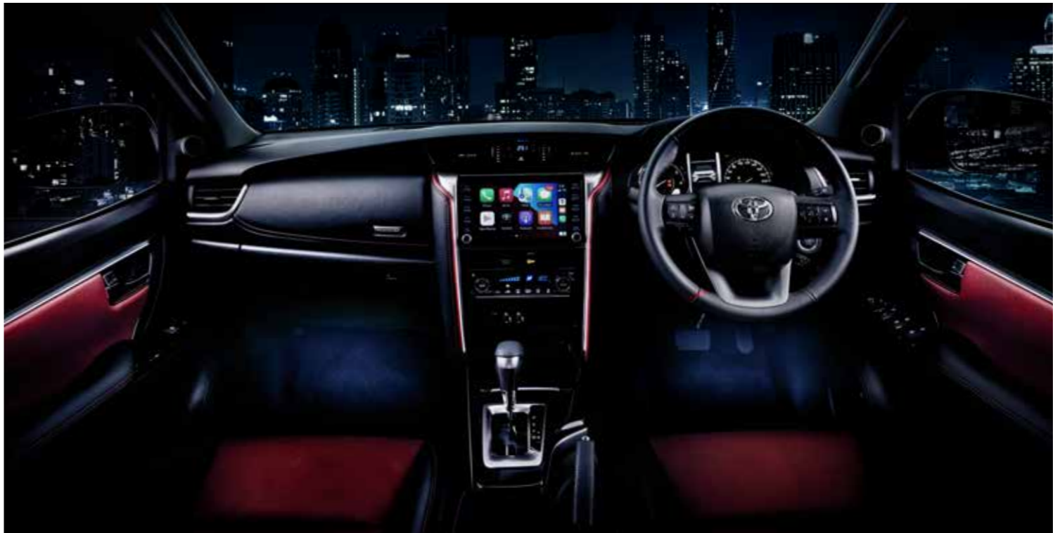
Interior Ambient Illumination for Instrument Panel, Front Door Trim & Front Foot-well Area