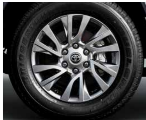
Multi-axis Spoke Alloy Wheels with Super Chrome Metallic Finish