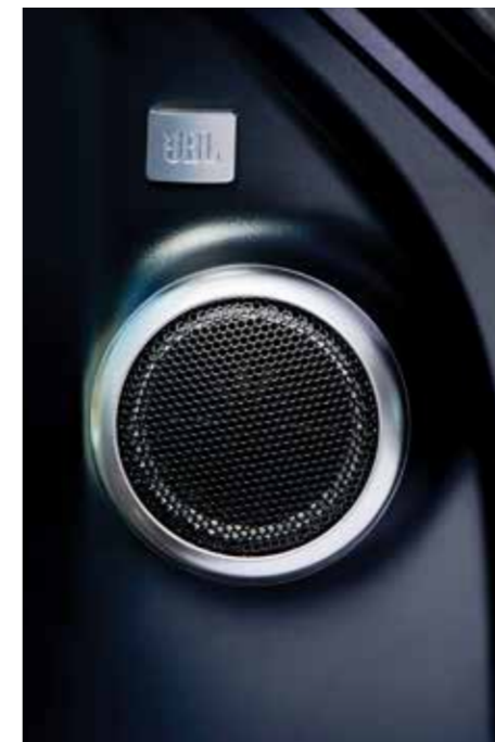
Premium 11 JBL Speakers Including Subwoofer*