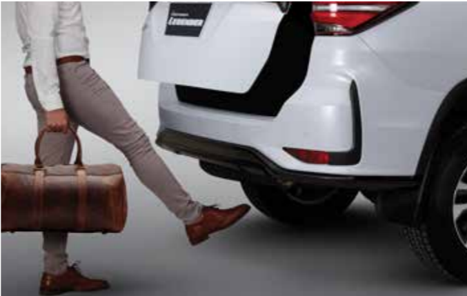
Kick Sensor for Power Back Door