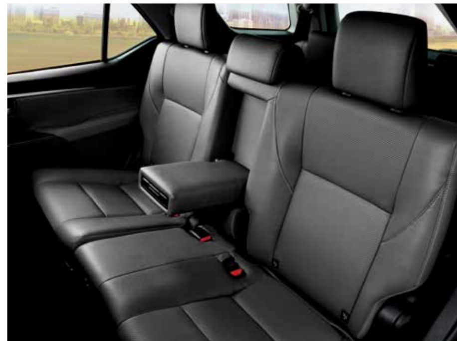
New Black Interior* & Chamois Colour Options