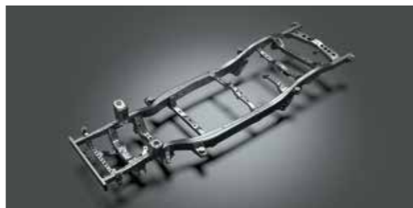
Tough Body on Frame Chassis

The new Legend and Fortuner brings you the best of both worlds. They combine incredible power with legendary styling like never-before. They have been mated with a 6-Speed Diesel AT and MT as well as a 5-Speed Petrol MT and a 6-Speed Petrol AT. Add to this the formidable body on frame chassis and you can unleash the incredible power to tame not just the cityscapes but the road less travelled. And that too with panache.