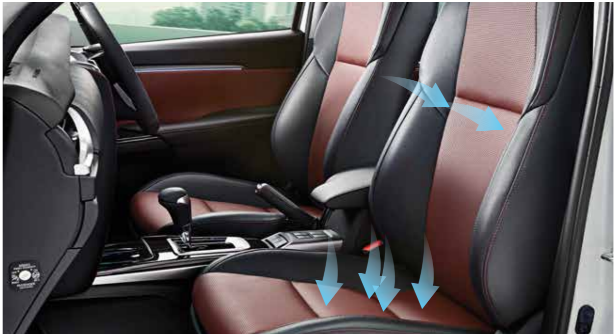
Superior Suction based Seat Ventilation System