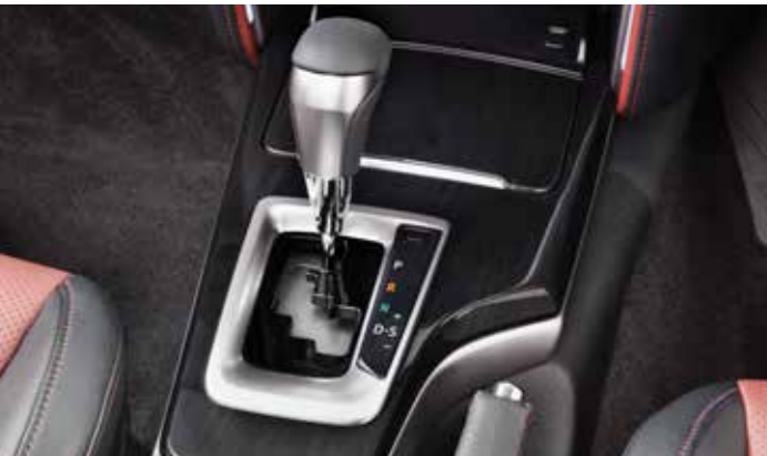
Gear Handle with Galaxy Black Ornamentation