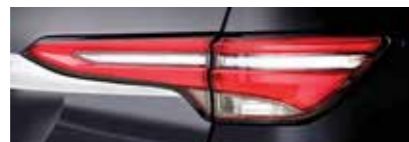
New Design Split LED Rear Combi Lamp