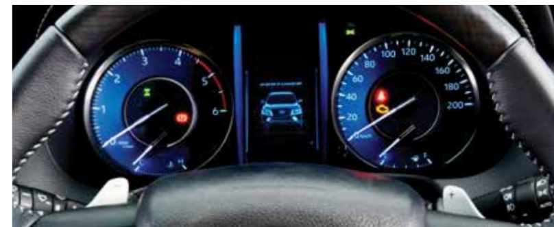
Cool Blue Combimeter Theme with Silver Ornamentation