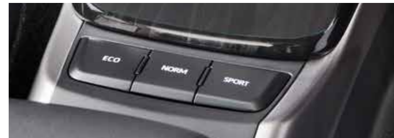
Driving Modes (Eco/Normal/Sport)