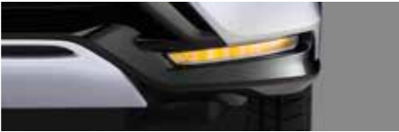
Sequential Turn Indicators