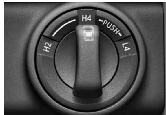
Electronic Drive Control*