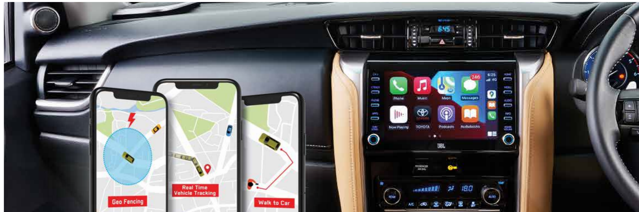
Connected Car Technology