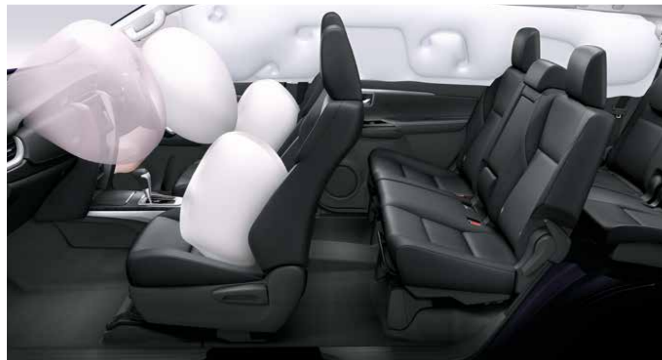
7 SRS Airbags