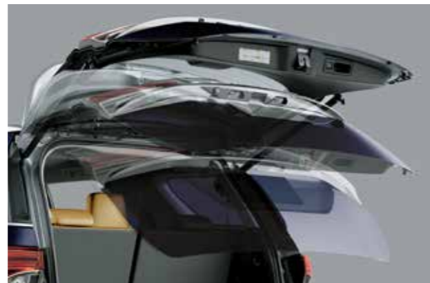
Electronically Controlled Power Back Door with Memory & Jam Protection