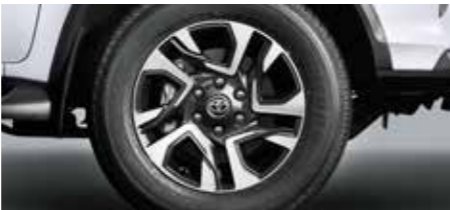
18" Multi-layered Machine Cut Alloy Wheels