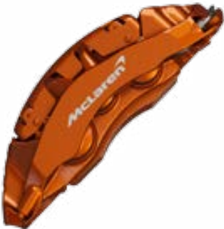
Azores with Machined McLaren logo