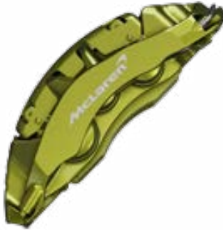
Flux Green with Machined McLaren logo