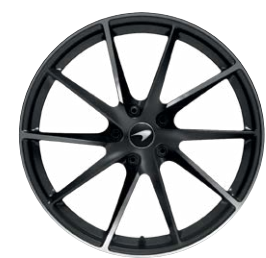
Satin Diamond Cut