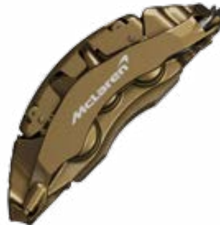
MSO Defined Bronze with Machined McLaren logo