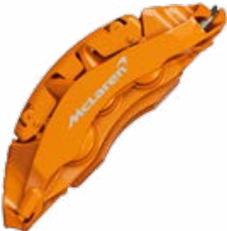
McLaren Orange with Machined McLaren logo