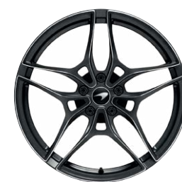
Satin Diamond Cut