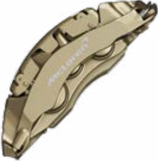
MSO Defined Speedline Gold with Machined McLaren logo