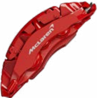
Red with Machined McLaren logo