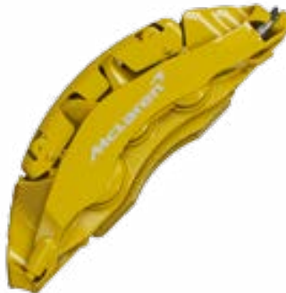
Yellow with Machined McLaren logo