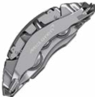
Polished with Machined McLaren logo