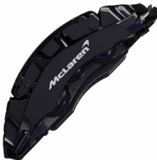
Black with Silver printed McLaren logo