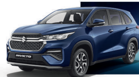
NEXA BLUE (CELESTIAL)