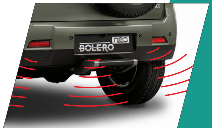
Intellipark reverse assist