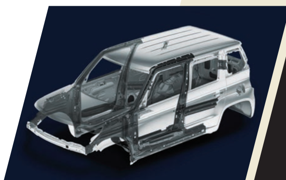
High strength steel body shell