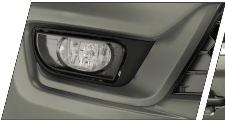
Stylish fog lamp