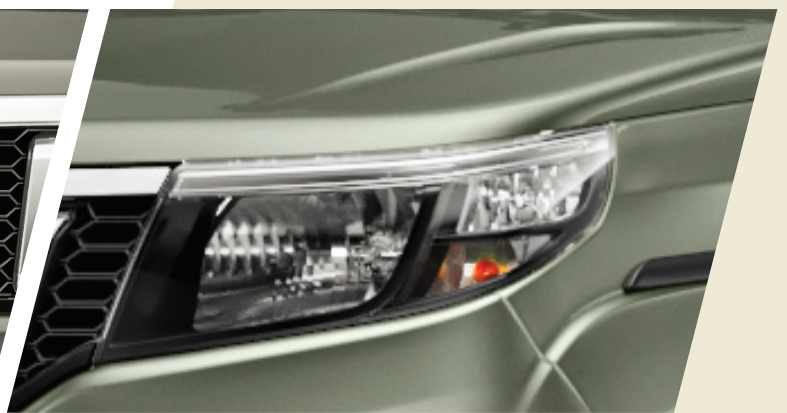
Sporty headlamps with DRLs