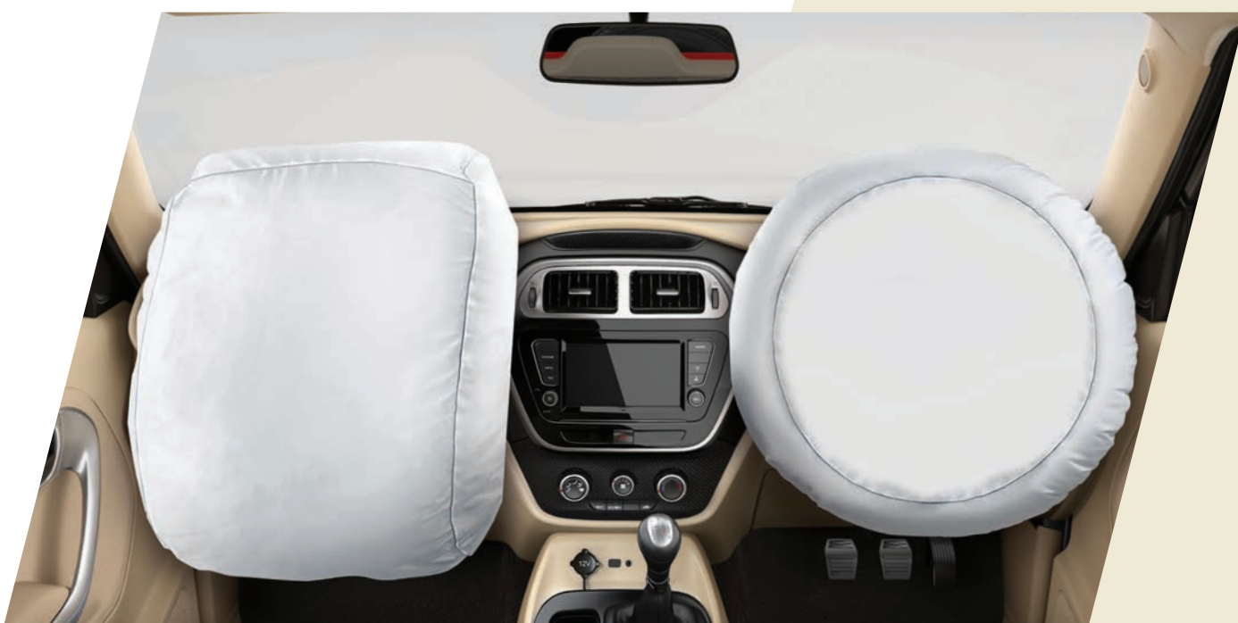
Dual airbags for driver and co-driver