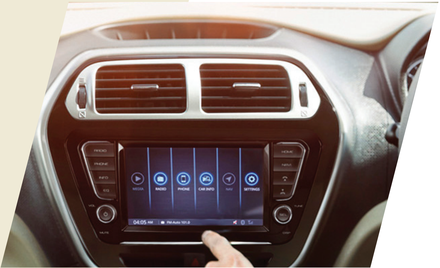
Advanced 17.8 cm touchscreen infotainment system