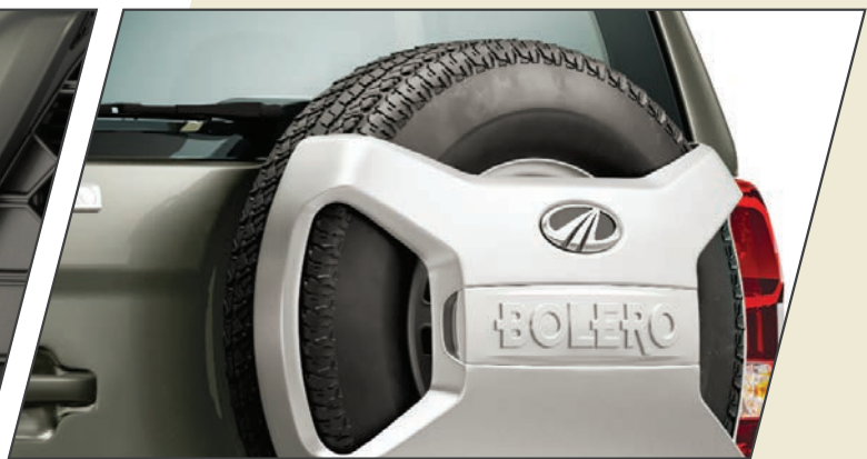
Signature Bolero branding on spare wheel cover