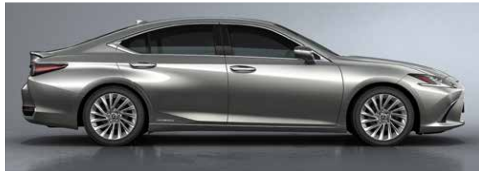
Sonic Titanium <1J7>