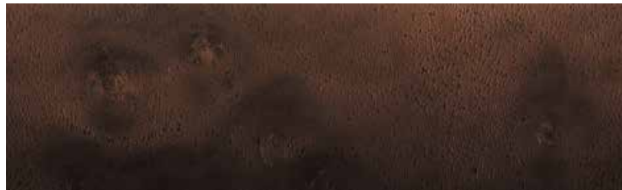
Walnut (Open Finish/Brown)