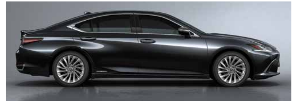
Graphite Black Glass Flake <223>