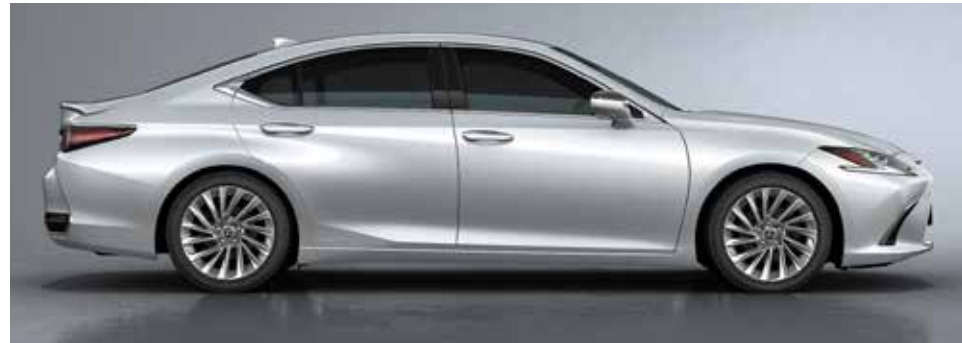
Sonic Quartz <085>

The ES is available in a selection of captivating and stimulating exterior and interior colors. Its rich form shows a changing face to the world in different light conditions such as sunlight and streetlights at night, providing a dramatic view that changes with the location and time of day.