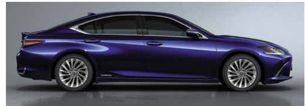
Deep Blue Mica <8X5>