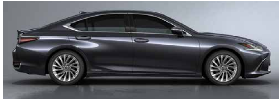
Sonic Chrome <1L1>