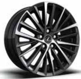
45.72 cm (18-inch) Aluminum wheels