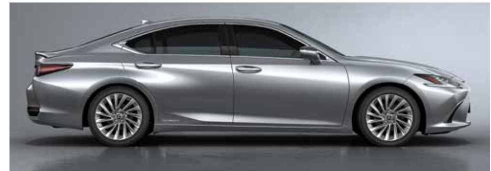
Sonic Iridium <1L2>