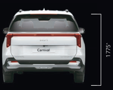
#With Roof Rails