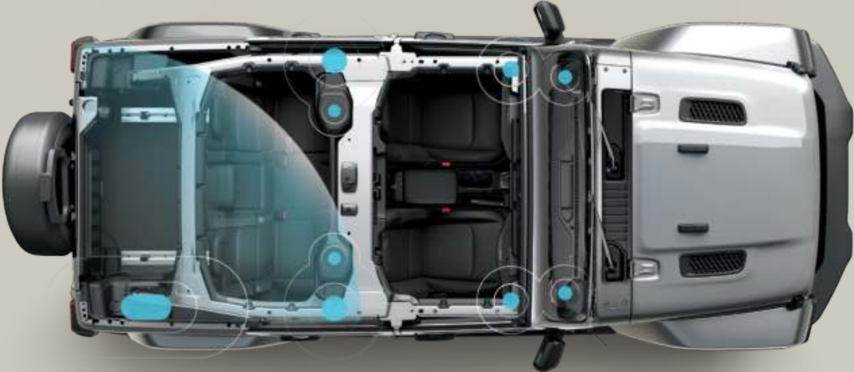
Optional spare tire cover shown.

Immerse yourself in an exhilarating audio experience with nine speakers, including an overhead sound bar, all-weather subwoofer and 552-watt amplifier. Available.