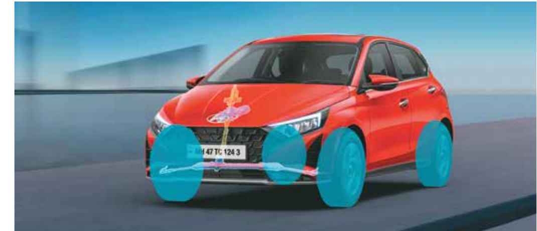
Electronic stability control (ESC) with vehicle stability management (VSM)

Other features: Impact sensing auto door unlock | Speed sensing auto door lock | Automatic headlamps | Burglar alarm | Driver rear view monitor (DRVM) | Emergency stop signal (1 st in segment) 3-point seat belt & seat belt reminder (all seats) | Rear camera with dynamic guidelines | ISOFIX (standard)