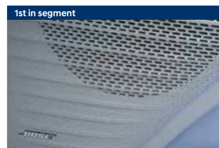
1st in segment Bose premium 7 speaker system

Other features: 60+ Bluelink connected features (Best in segment) | Multi-language UI support (12 nos.) (1 st in segment) | OTA updates for infotainment and map (1 st in segment) | Home to car (H2C) with Alexa (English & Hindi) | Cruise control | Rear AC vents | Multi phone bluetooth connectivity (1 st in segment)