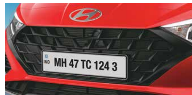
Parametric jewel pattern grille