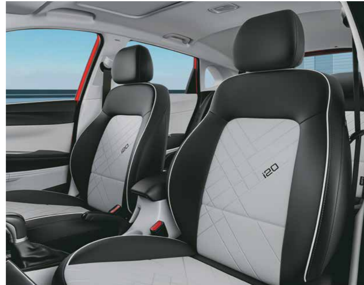
Dual tone seats with i20 branding

The interiors of the new Hyundai i20 mesmerize. Dual tone seats that look fabulous and enough space to lounge out in comfort. Ambient lighting that uplifts your mood and sliding front armrest that provides a more convenient way to relax.