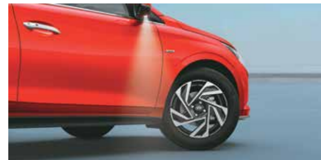
Puddle lamps with welcome function

Other features: Chrome outside door handles | Turn indicators on outside mirrors Painted black finish side sill garnish with i20 branding | Shark fin antenna