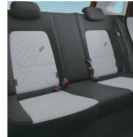
Spacious interiors with ample headroom, legroom and shoulder room