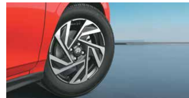
R16 (D=405.6 mm) diamond cut alloy wheels