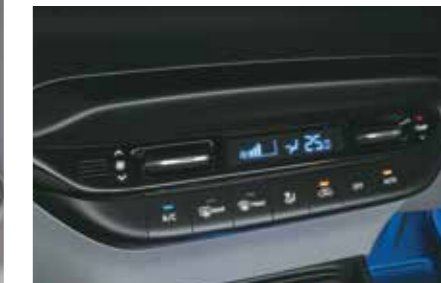
Fully automatic temperature control (FATC)