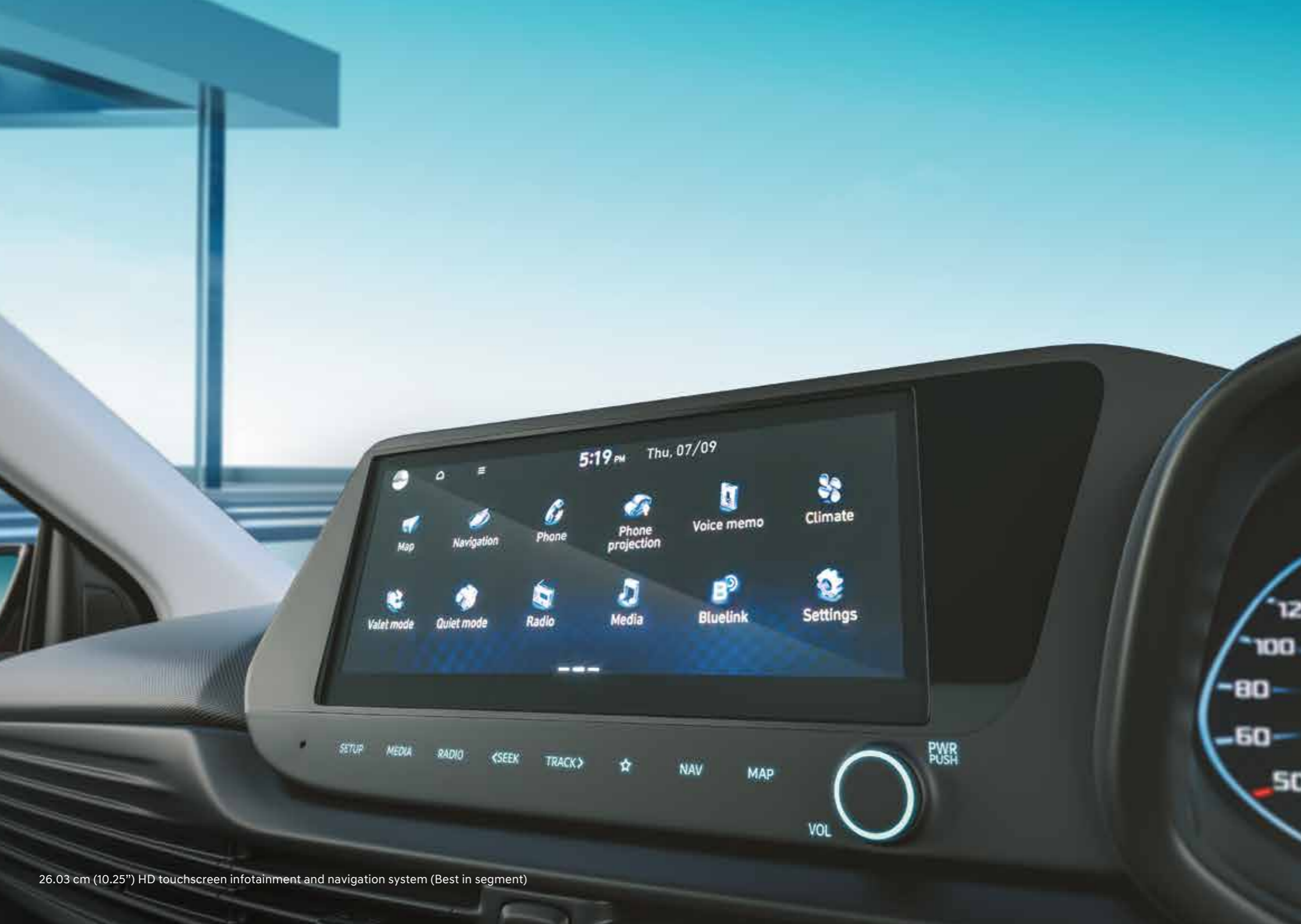
26.03 cm (10.25") HD touchscreen infotainment and navigation system (Best in segment)