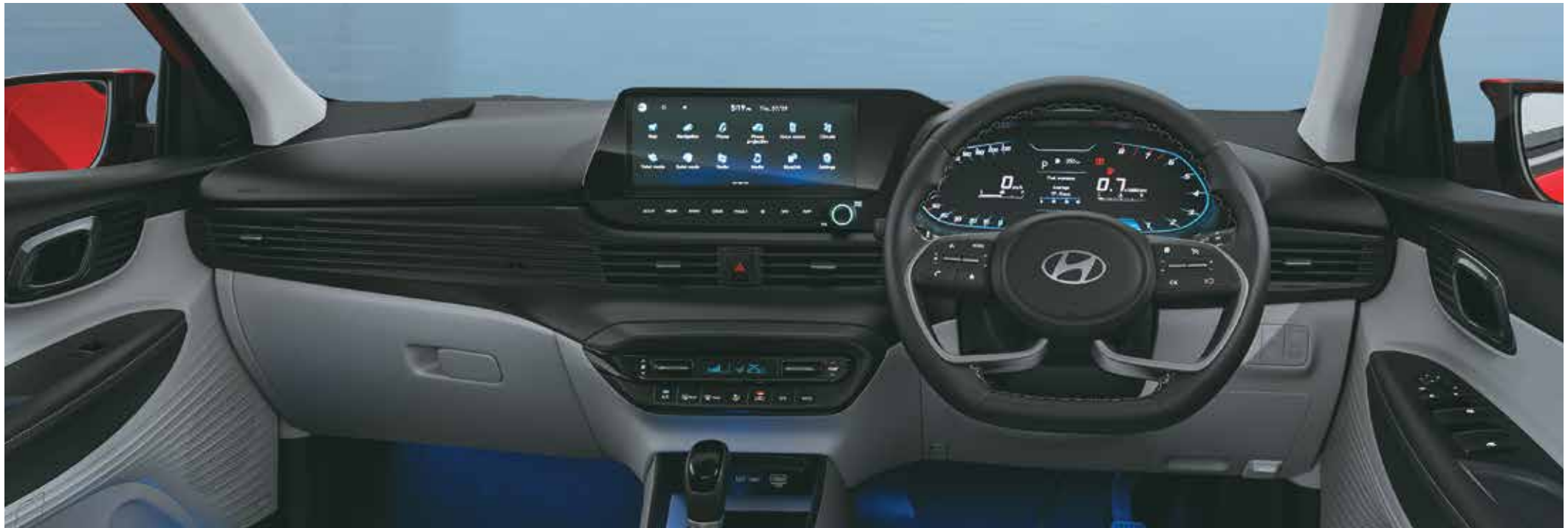
Dual tone black & grey interiors