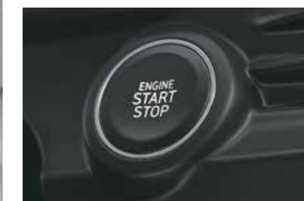
Push button start/stop