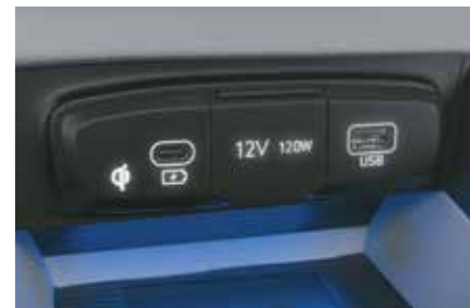
Fast USB charging (Type C)