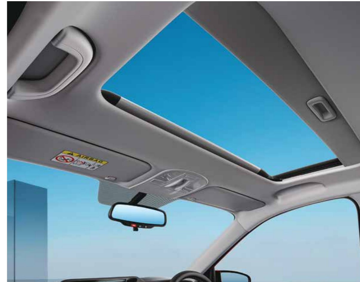
Voice enabled smart electric sunroof