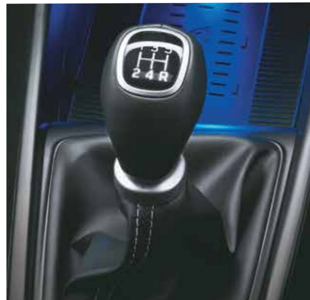
5 speed manual transmission