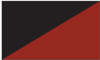
Fiery red with abyss black roof