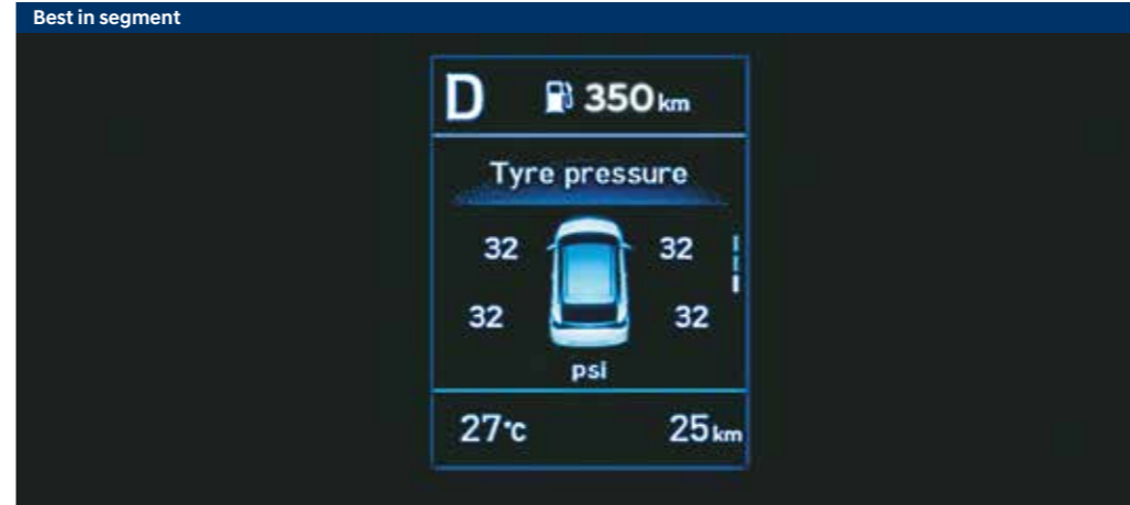
Best in segment Tyre pressure monitoring system (highline) with display on MID