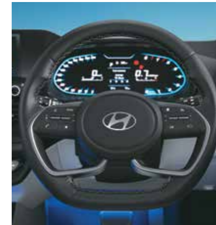
Leather wrapped D-cut steering