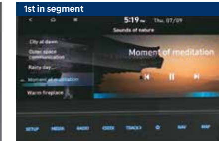
1st in segment Ambient sound of nature (7 nos.)