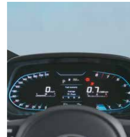
Digital cluster with TFT multi information display

Other features: Superior leg room and thigh support | Sliding front armrest | Leather wrapped steering wheel and gear knob | Metal finish inside door handles