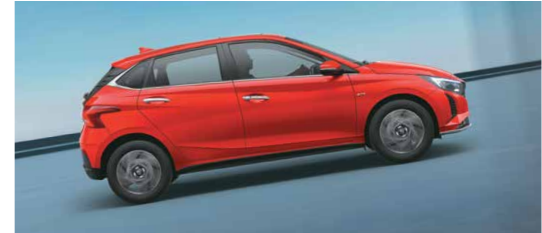
Hill-start assist control (HAC)