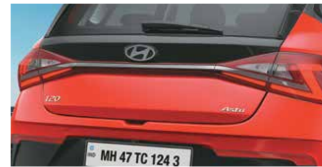
Stylish Z-shaped LED tail lamps