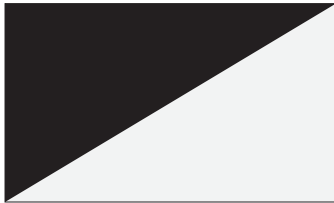
Atlas white with abyss black roof