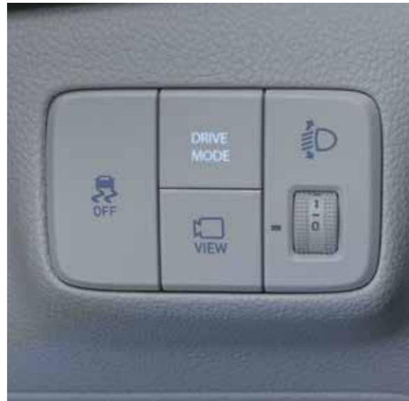
Drive mode select