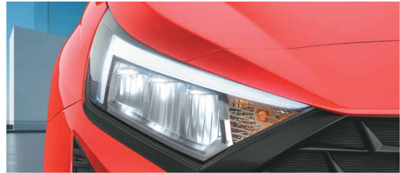
LED headlamps with signature DRLs

The new Hyundai i20 has it all. A sensuous sporty design, a majestic new grille and lights that are a showstopper. Turn heads as you whizz by on those alloy wheels and make an impression with the chrome lines. It's simply stunning from tip to toe.