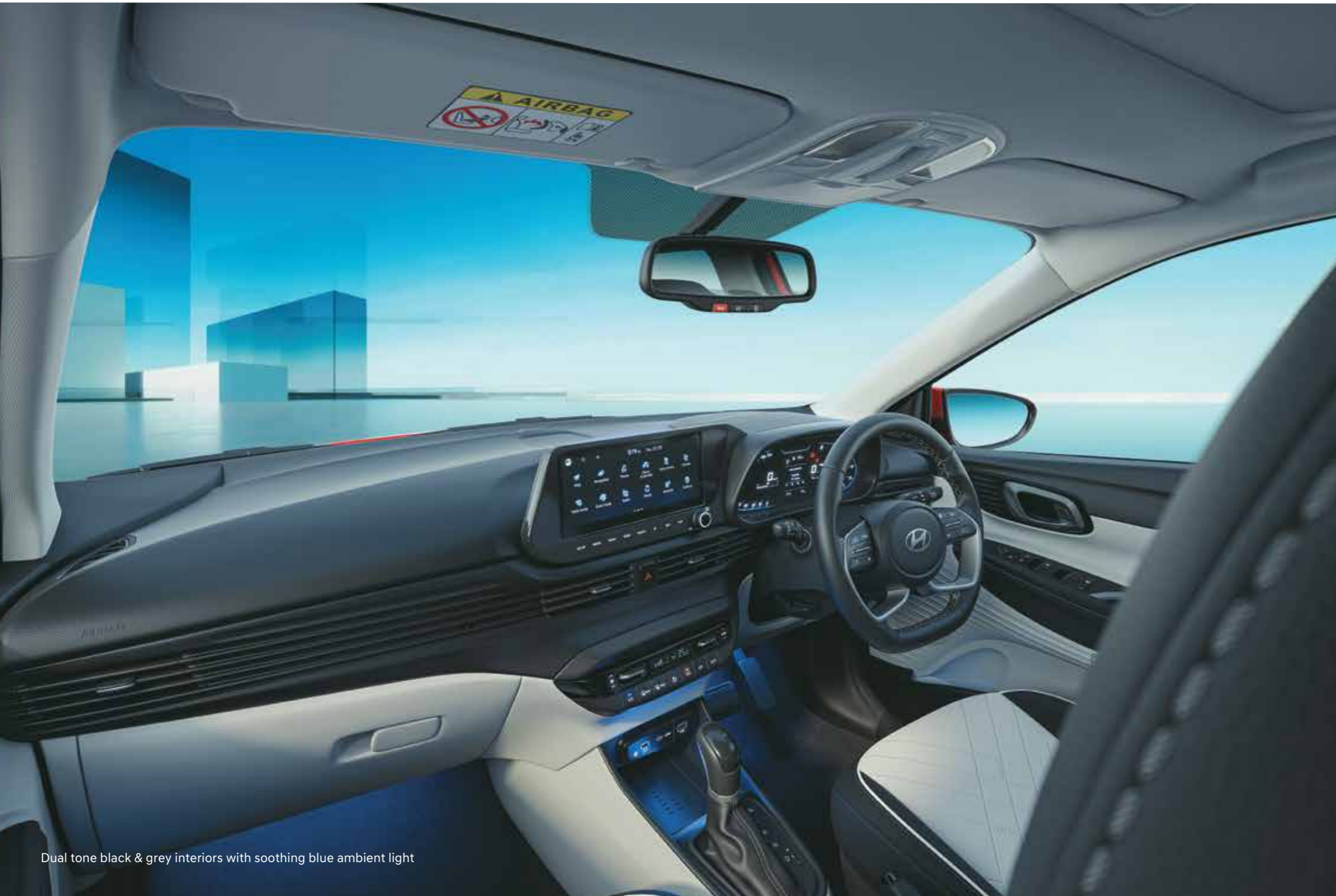
Dual tone black & grey interiors with soothing blue ambient light