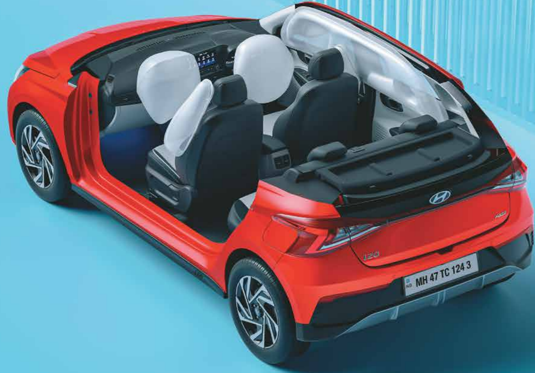
6 airbags standard (Best in segment)