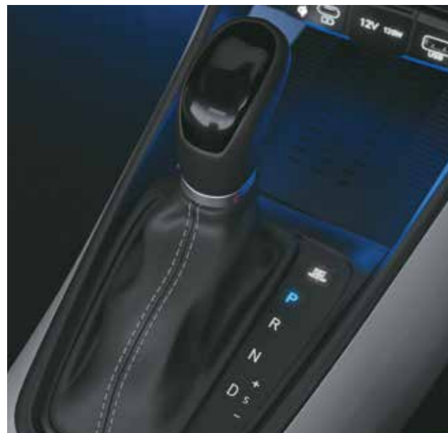
Intelligent variable transmission (IVT)