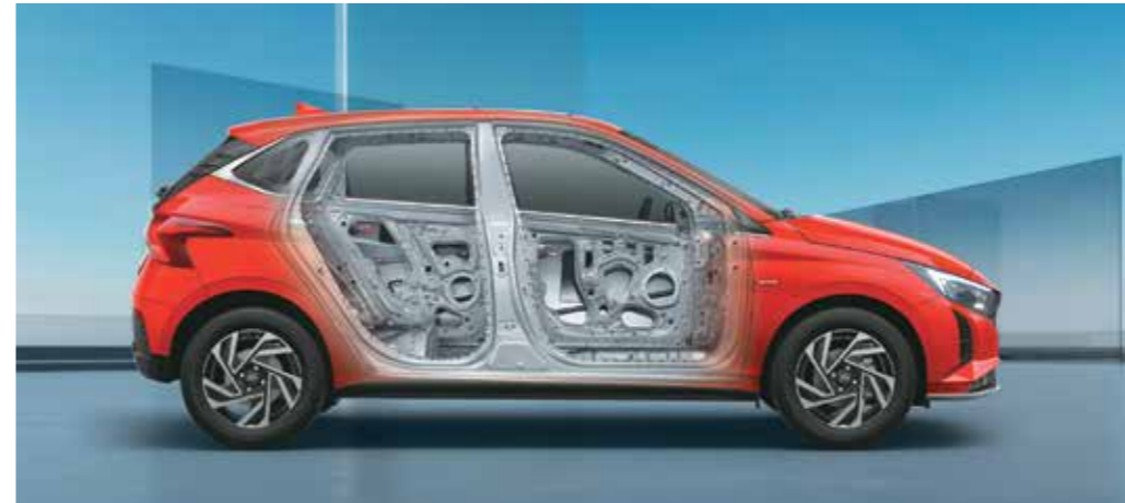
Strong body structure (with AHSS and HSS)