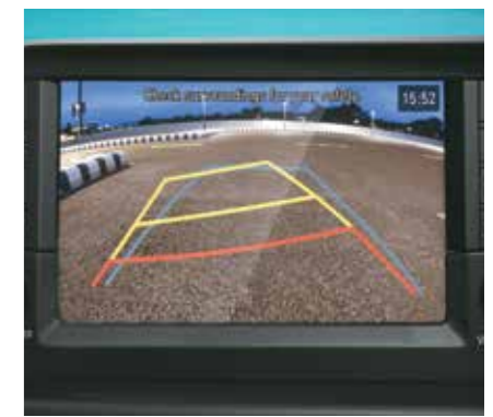
Rear view camera with dynamic guidelines