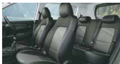
Light sage inserts