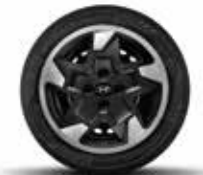
R15 (D=380.2mm) Dual tone styled steel wheel

All it takes is a look to know that Hyundai EXTER is for those who love to be outside. Be it the signature H-LED DRLs, EXTER branding on the front bumper, sporty bridge type painted black roof rails, dynamic painted black rear spoiler, everything makes Hyundai EXTER look spectacular and ready for outside.