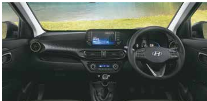
Black interiors with light sage inserts