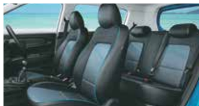
Cosmic blue inserts