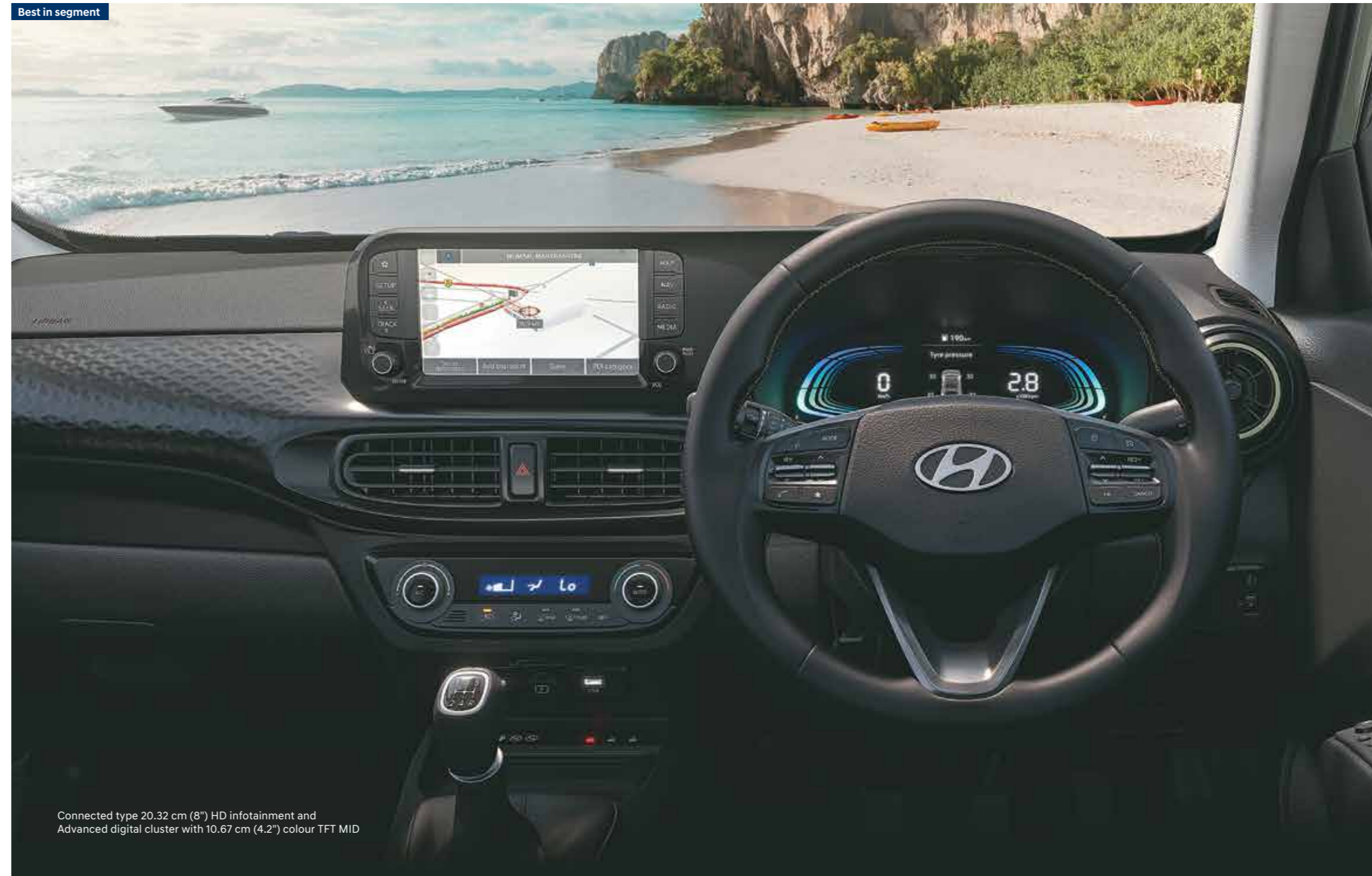
Connected type 20.32 cm (8") HD infotainment and Advanced digital cluster with 10.67 cm (4.2") colour TFT MID

Other features: On-board navigation (1 st in segment) | Smartphone connectivity - Android Auto and Apple CarPlay | C-Type USB charger (Best in segment) Embedded voice commands (92 nos.) | Steering wheel with audio & Bluetooth control