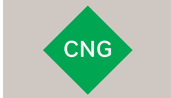
1.2 l Bi-fuel Kappa petrol with CNG