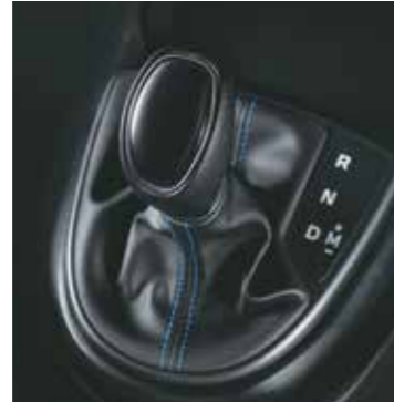
Automated manual transmission (AMT)