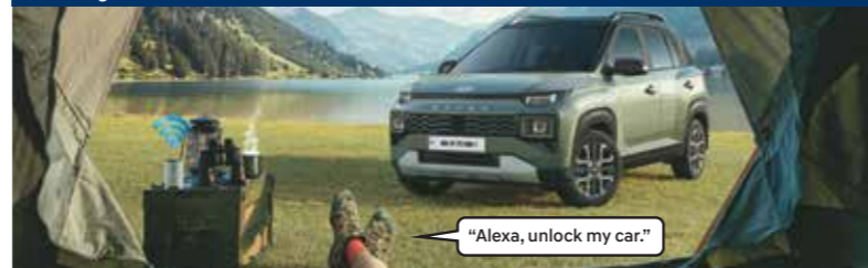
Home to car (H2C) with Alexa*** (English & Hindi)