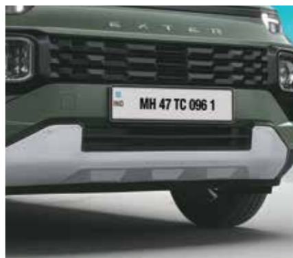
Parametric designed front grille Solid & wide front skid plate