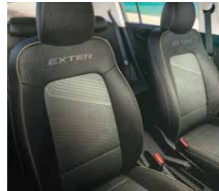
Sporty semi-leatherette upholstery

Other features: Adjustable rear headrest | Cooled glove box