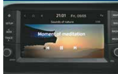
Ambient sounds of nature (7 nos.)