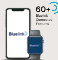
BlueLink connected car technology (Free for 3 years)