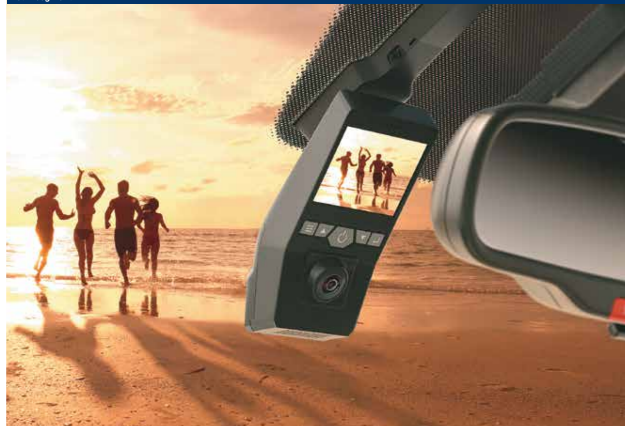
Dashcam with dual camera