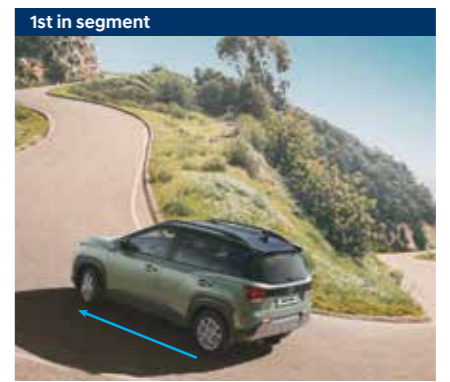
Hill-start assist control (HAC)