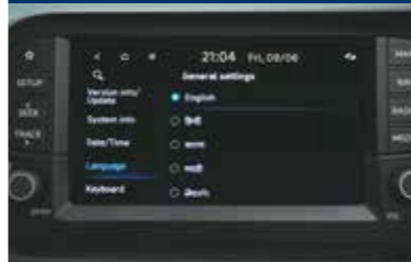
Multi-language UI support (12 nos.)