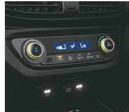
Fully automatic temperature control (FATC) with digital display