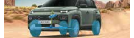
Vehicle stability management (VSM)