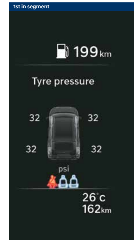
Tyre pressure monitoring system – Highline

Hyundai EXTER is all about making every drive exciting and keeping you safe. It comes with 6 airbags as standard. This SUV offers over 40 advanced safety features and 26 safety features available across all trims, so the only thing on your mind is making the most of your drive.