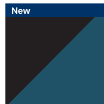
Cosmic blue with abyss black roof