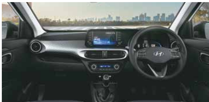
Black interiors with silver inserts