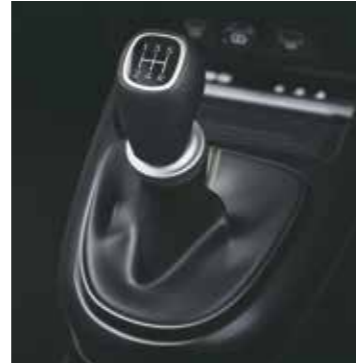
Manual transmission (MT)