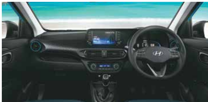
Black interiors with cosmic blue inserts