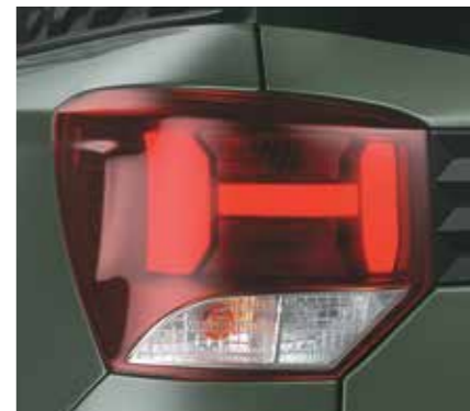
Signature H-LED tail lamps