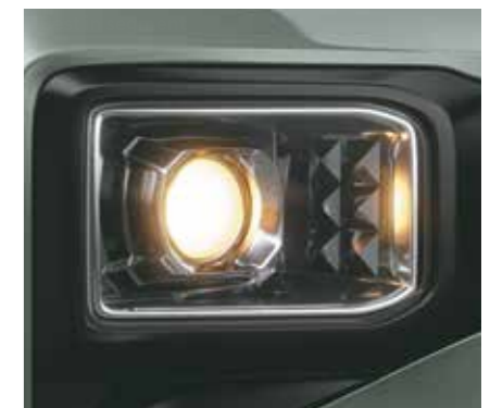
Projector bi-function headlamps