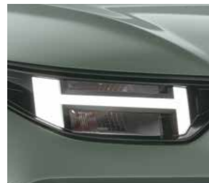
Signature H-LED DRLs and positioning lamps