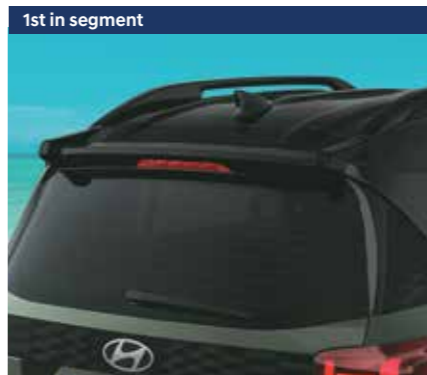
Painted black rear spoiler & roof rails