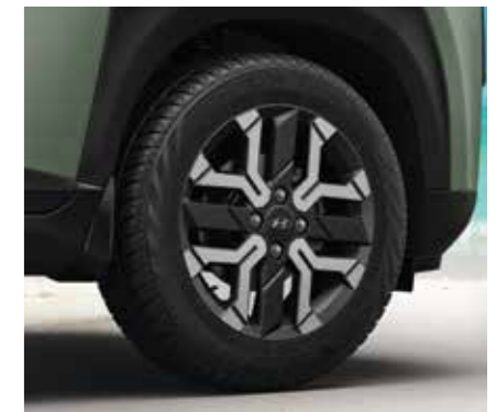
R15 (D=380.2 mm) Diamond cut alloy wheels

Other features: Shark fin antenna (1st in segment) | Muscular wheel arch cladding