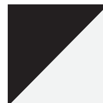
Atlas white with abyss black roof