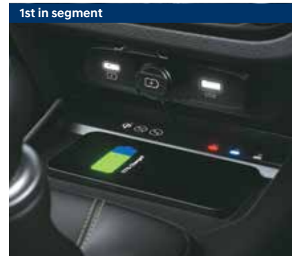
Wireless phone charger*