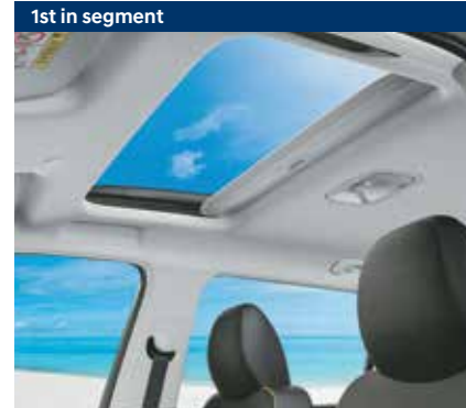
Voice enabled smart electric sunroof

When you get inside Hyundai EXTER, you know there is room for you as well as everything you love. Its spacious interiors have been crafted to offer utmost comfort, so every moment of your journey is exhilarating and you are all set for outside.