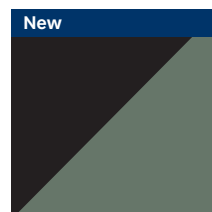
Ranger khaki with abyss black roof