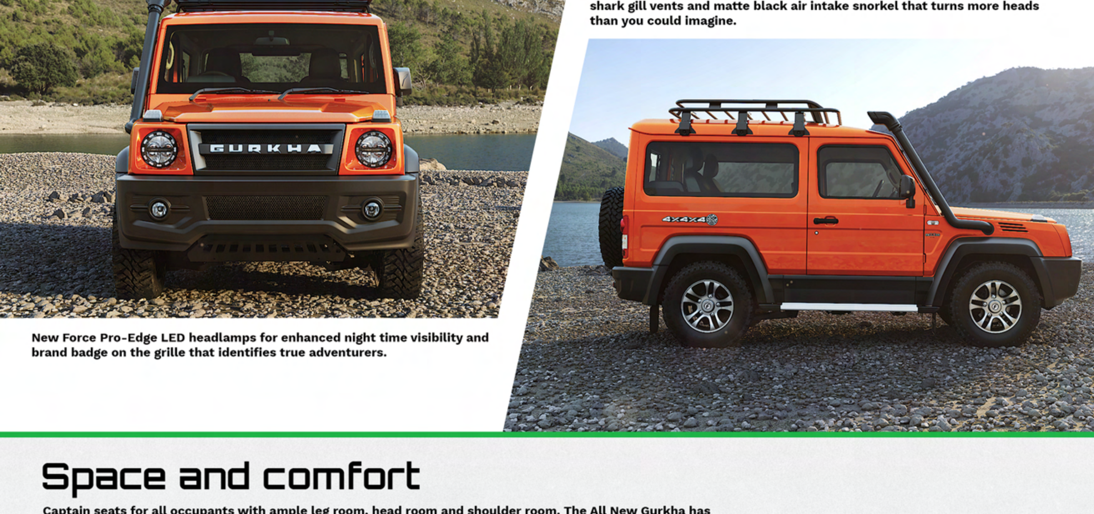
New Force Pro-Edge LED headlamps for enhanced night time visibility and brand badge on the grille that identifies true adventurers.