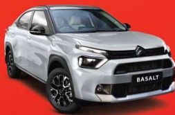
Polar White Body with Perla Nera Black Roof