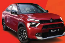
Garnet Red Body with Perla Nera Black Roof