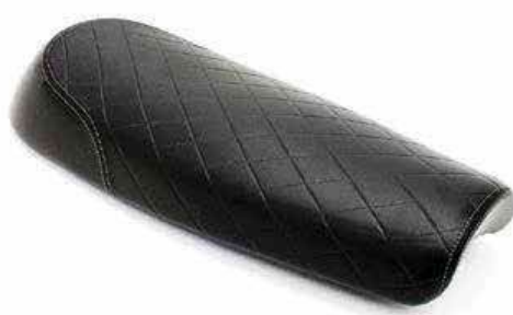
BLACK PREMIUM TOURING DUAL SEAT 1990482