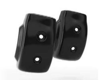
BLACK HEEL GUARD 1990444