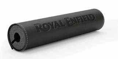
BLACK INTAKE COVERS 1990442