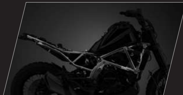
STURDY STEEL FRAME