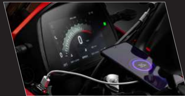
DUAL USB PORTS