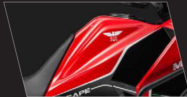
18 LITRES FUEL TANK