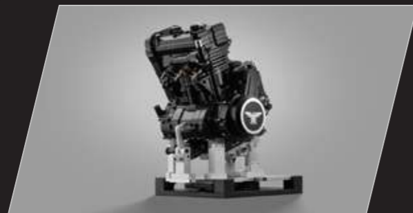
HIGH PERFORMANCE MACHINE