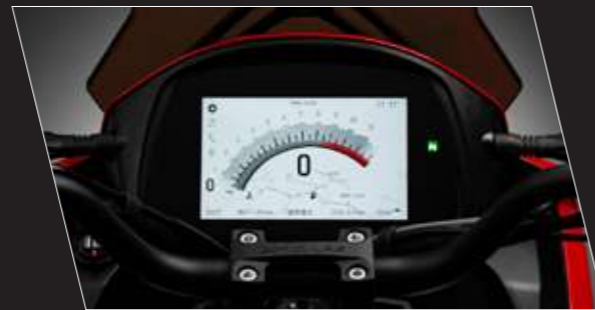
7" TFT DISPLAY