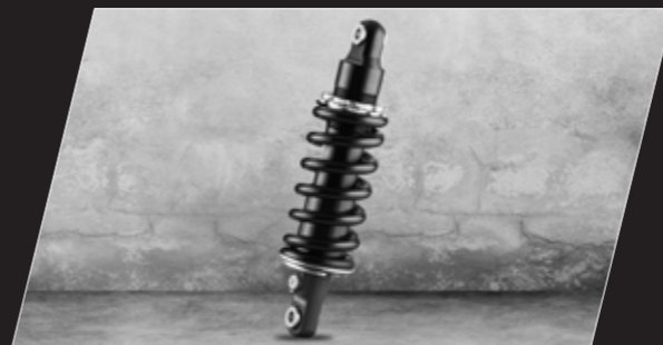
FULLY ADJUSTABLE SUSPENSION