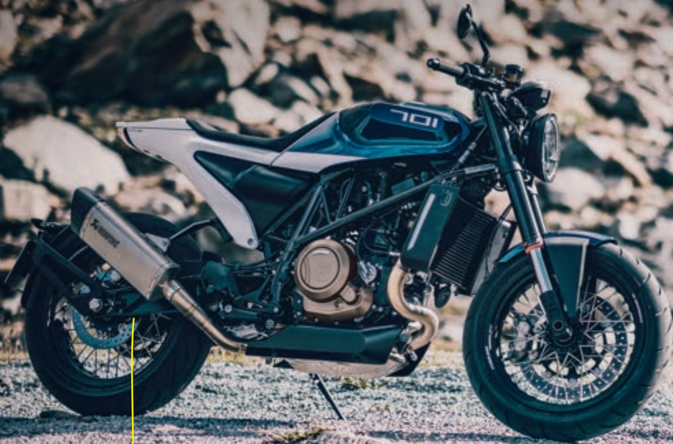
AKRAPOVIČ "SLIP-ON LINE"

Individual performance, distinctive style.