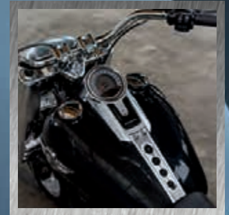
BULLET HOLE TANK CONSOLE