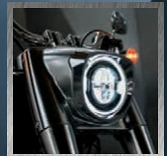
DAYMAKER™ SIGNATURE LED HEADLAMP