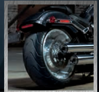
240MM REAR TIRE