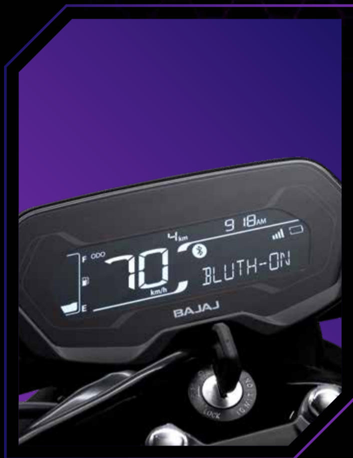
BLUETOOTH ENABLED DIGITAL CONSOLE