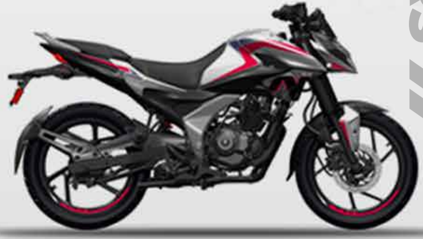
PEARL METALLIC WHITE