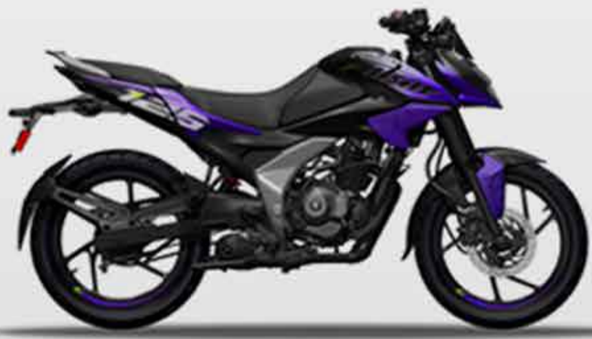
EBONY BLACK PURPLE FURY