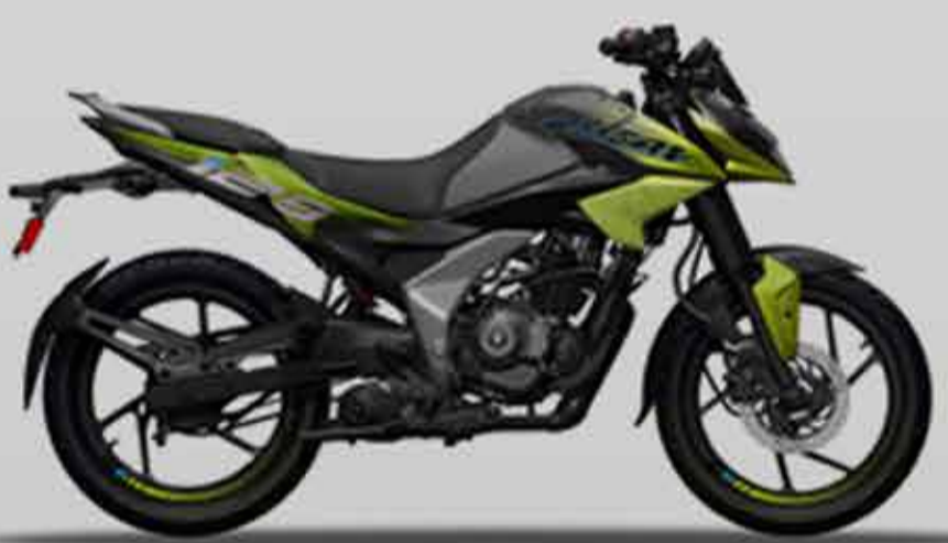
PEWTER GREY CITRUS RUSH