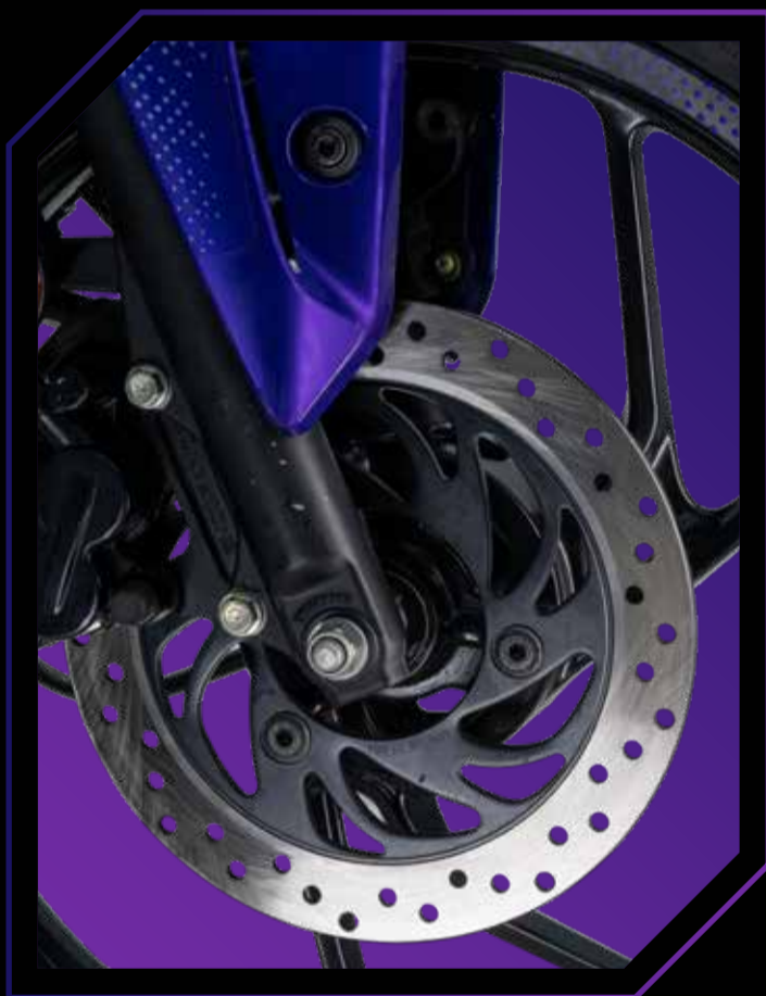
240 MM DISC BRAKE