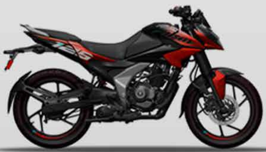
EBONY BLACK COCKTAIL WINE RED